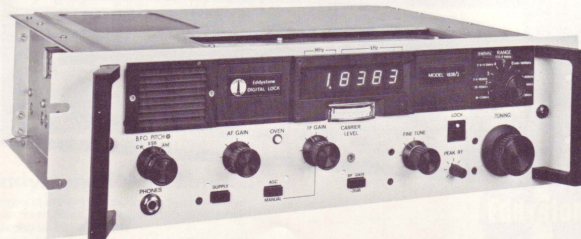
Rack Mounted version of Model 1838/3 illustrated, one of the 1837/8 comprehensive series of communication Receivers.

Separate AGC systems are employed for the RF and IF stages with provision for manual control of IF gain when required. The RF AGC line is permanently connected. The IF AGC line is brought out for interconnection when operating receivers in dual diversity and is also used to operate the integral meter to indicate carrier level. In addition to carrier level the meter is switched to indicate FSK tune condition (Centre zero) and 600ohm line level output. For FSK operation keying speeds of 300 bauds and shifts of 85Hz upwards can be accommodated when FSK module LP3499 is fitted. Audio outputs are available for loudspeaker, headset and lines, the line output being fed from an independent low-level amplifier with adjustable pre-set gain control. A monitor speaker is fitted and all external connections except the headset socket are located at the rear. An aerial muting relay and input attenuator are also incorporated.